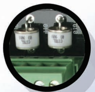
On-board lightening protection

The K-2<sup>™</sup> slide gate operator raises the bar in quality for the residential market. This machine operates a highly efficient direct motor drive which allows operation at 100% duty cycle. This assures efficiency and reliability. The fail-safe, fail-secure options of the K-2<sup>™</sup> gate operator allows it to handle gates up to 650 lbs. in conformance with UL 325 and UL 991 Type I, III and IV. This operator is UL Listed 18TC UL325 and UL991.