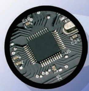
Soft-Stop / Soft-Start with intelligent Obstruction Detection

Back-drivable unit features direct drive mechanism